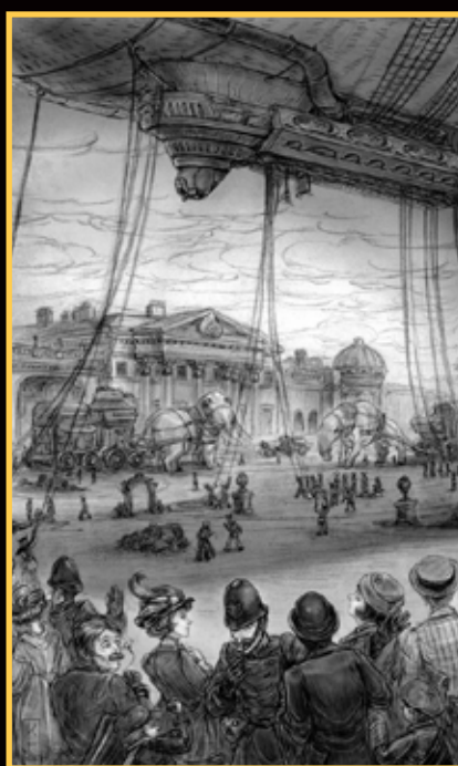
"MOORING AT REGENT PARK."